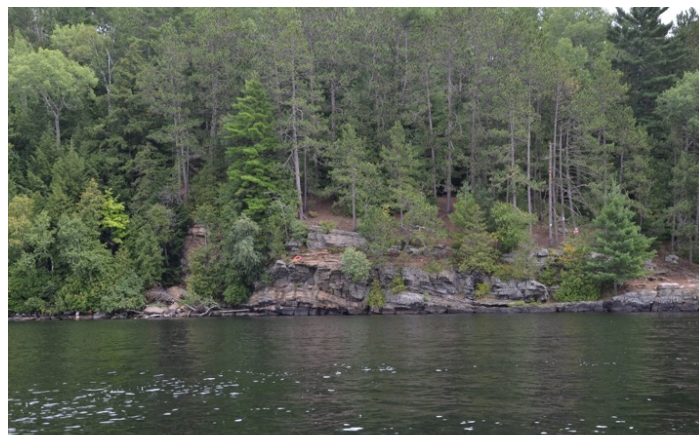
Gull Lake Shoreline to protect

Further details can be found on the County of Haliburton-Shoreline Preservation website.