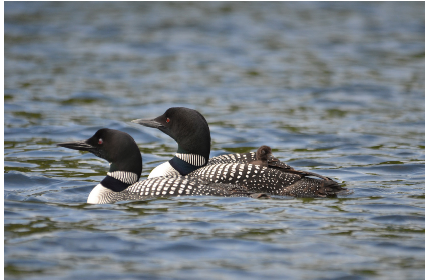
NATURE Baby Loon Born June 20 th Early Morning